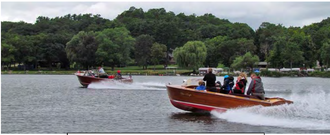
Two of the Chris Crafts making deliveries on July 27th