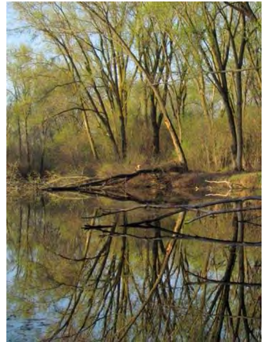
Trees and reflections at Sunnyside Conservancy

Call us with your comments, questions or ideas. We want to hear from you! 920-229-4841