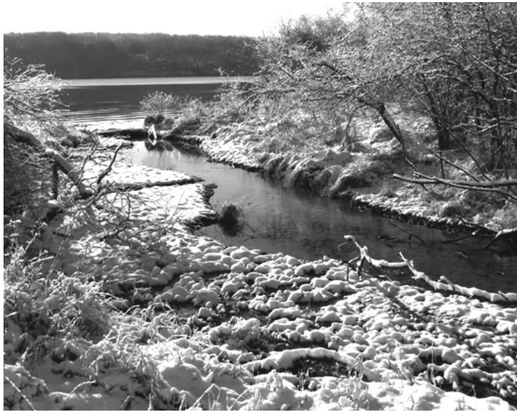
Winter view of creek entering Norwegian Bay from Assembly Creek and Springs Conservancy