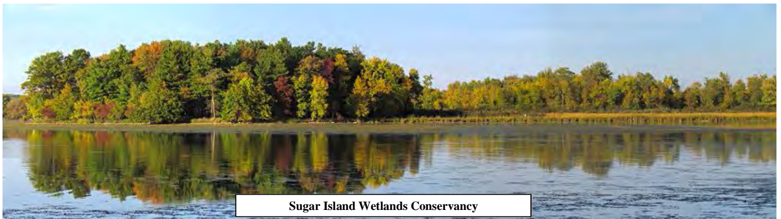
Sugar Island Wetlands Conservancy