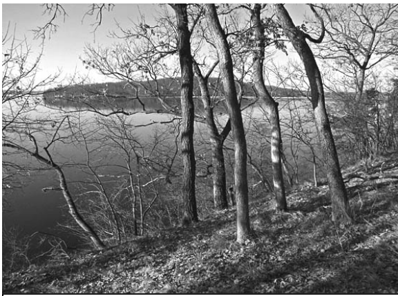
View of Green Lake from Winnebago Trail Conservancy

type of activity up until 1997 and there wasn't any mention of this work during my interactions with the GLSD Board of Commissioners during my hiring process in the Spring of 1996.