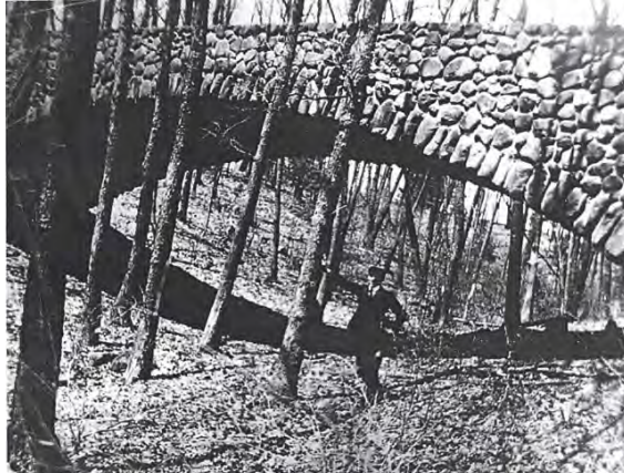
Historic photo of one of the three stone arches that border the Winnebago Trail Conservancy