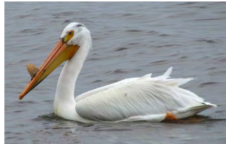
American White Pelican

Hours of business: 9 AM—6 PM Monday-Friday 9 AM—1 PM Saturday Phone: 920-294-4244